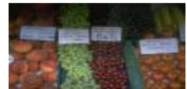
December 6th, 2006

For more information about Pesticide Recertification contact WSDA licensing @ (509) 225-2639.