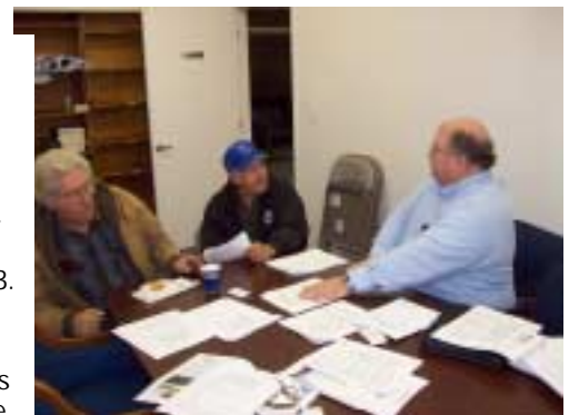
Held in the RCDR's Small Business Incubator

This program is one of the least accessed by minority producers because of its highly competitive nature among corporate farming and business operations.