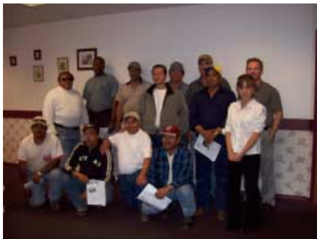
Tonasket Farmers & Center Staff pose after the meeting